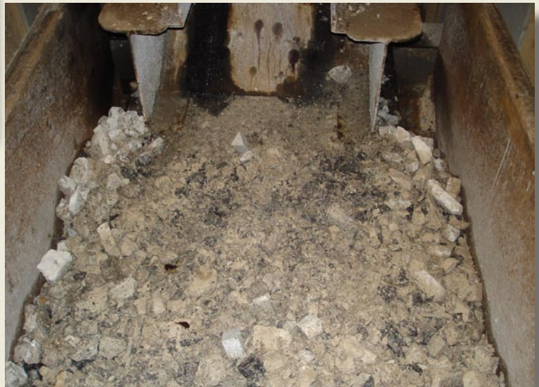
Crushing machine used at Blume's processing facility. Crushed material is currently used as fill for Blume's parking lots.

As Marketing Manager Ashley Blume asserts, "By using our stone crusher and cardboard bailing system, we have seen great improvements in the frequency and cost it takes to remove our waste. By creating our own fill for our parking lots, we eliminate the need to constantly purchase from outside sources. Our water purification system nearly eliminates the amount of fresh water that is needed in our production process."